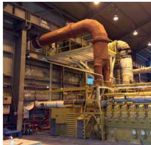
PT. Freeport Indonesia – Irian Jaya, Indonesia.

Underground 12,000 litre fuel tank installation.