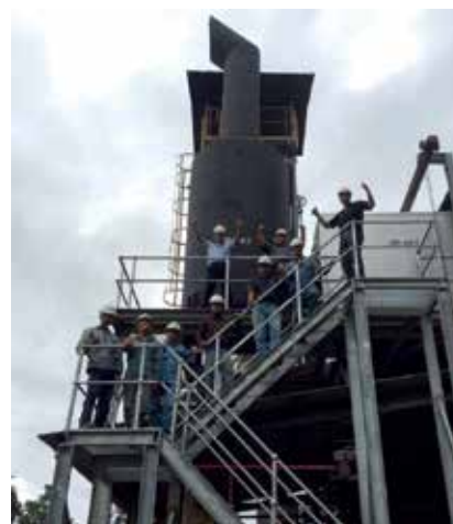
PT. Freeport Indonesia – Irian Jaya, Indonesia.

Complete design, supply and install of Selective Catalytic Reduction (SCR) system, achieving an 85% reduction in NOx, and entire exhaust system for CAT 4700KW Genset.