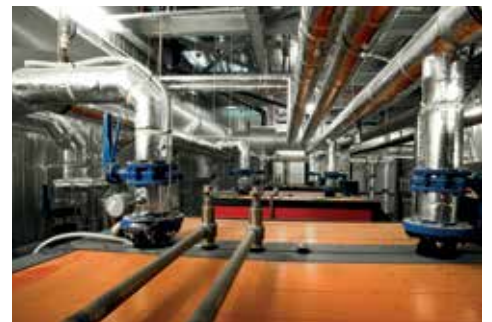
111 Eagle Street Project – Brisbane, Australia ECI worked with Leighton Contractors, Q Electrical and Triple M Mechanical Services to deliver outstanding design innovation, superior acoustic products and emission reduction technologies to one of Queensland's most inspiring building developments.