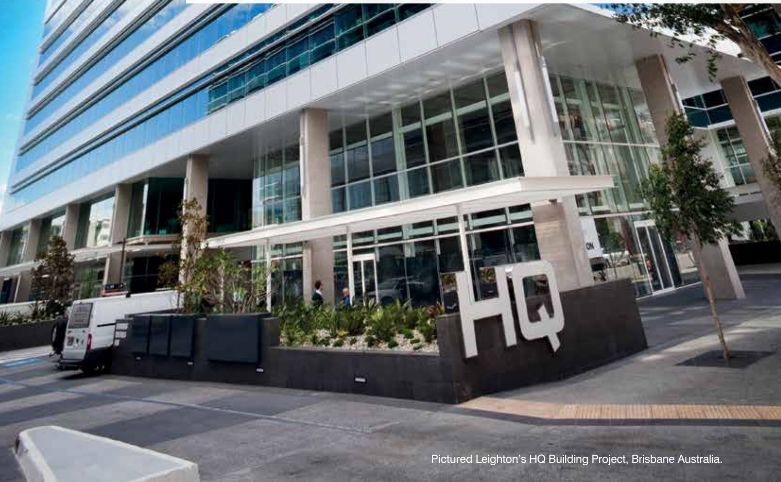
Pictured Leighton's HQ Building Project, Brisbane Australia.