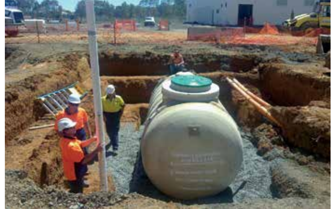
Ararat Prison – Victoria, Australia.

Underground 12,000 litre fuel tank installation.