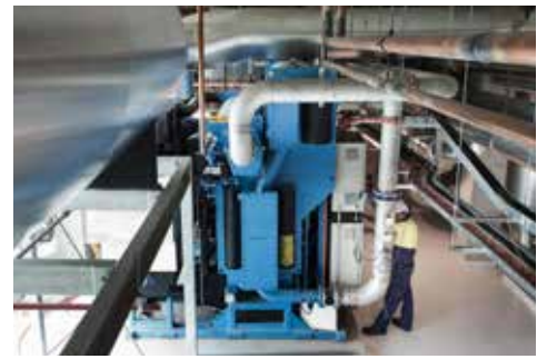
Queensland University of Technology Garden Point Campus – Brisbane, Australia. ECI worked with Leighton Contractors Siganto and Stacey Air Conditioning and Mechanical Contractors to deliver outstanding design innovation in energy efficiency products and emission reduction technologies to one of the leading Australian Universities.